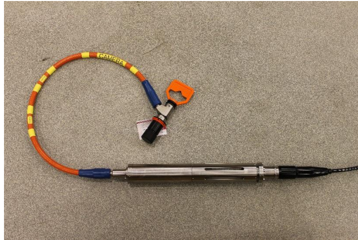
Subsea Fiber Optic Cable to an ethernet connection.